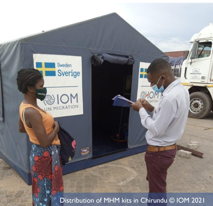
Distribution of MHM kits in Chirundu